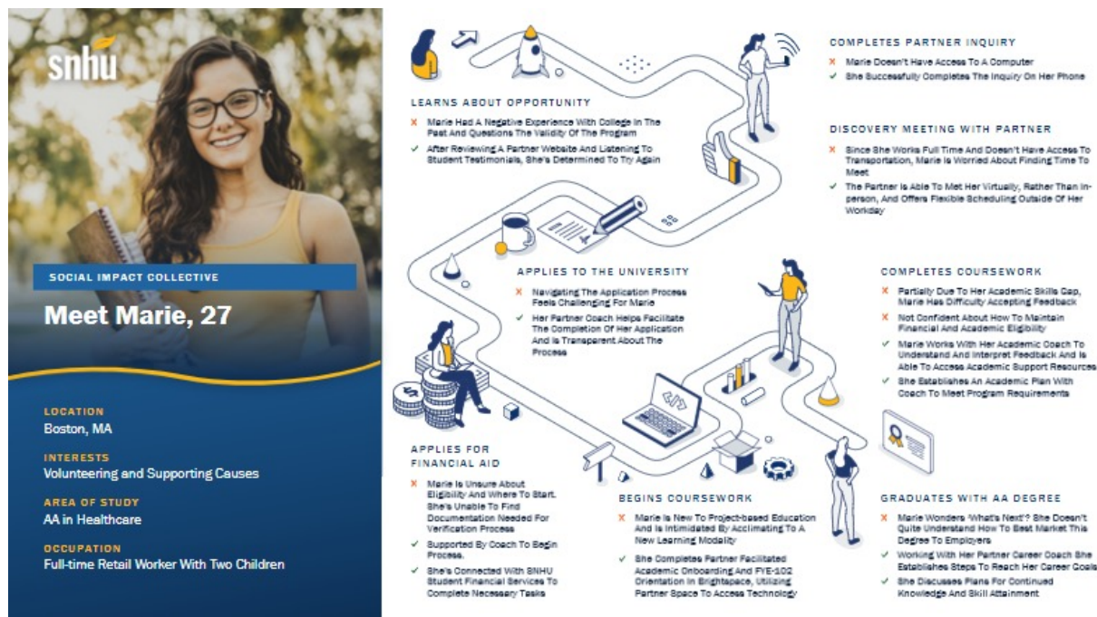
Figure 1. The Duet-SNHU Learner Journey

Despite the challenges facing learners during the pandemic, the Duet-SNHU model actually experienced growth during this time period (see Figure 2). Duet-SNHU's enrollments jumped from 709 in 2019 to over 1,120 in 2020. Among Duet students, approximately 64% are women, 43% are Black or African American, and 38% are Hispanic or Latinx. In working with students, Duet-SNHU staff have noted that the flexibility and affordability of the model made it the right option for many learners when traditional higher education wasn't. The online CBE format makes the program available on-demand and on learners' schedules, enabling accelerated or self-paced progress.