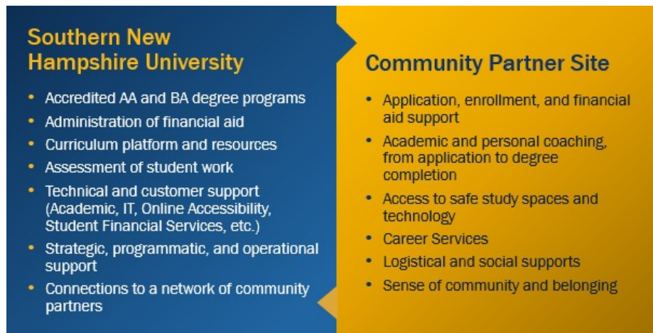
Figure 3. Overview of Duet-SNHU Program Delivery

In practice, the model is delivered in two parts, academic delivery at SNHU that blends the low-cost flexibility of online CBE with face-to-face, customized support at the Duet-SNHU site. The program's two-part delivery is depicted in detail below (Figure 3).